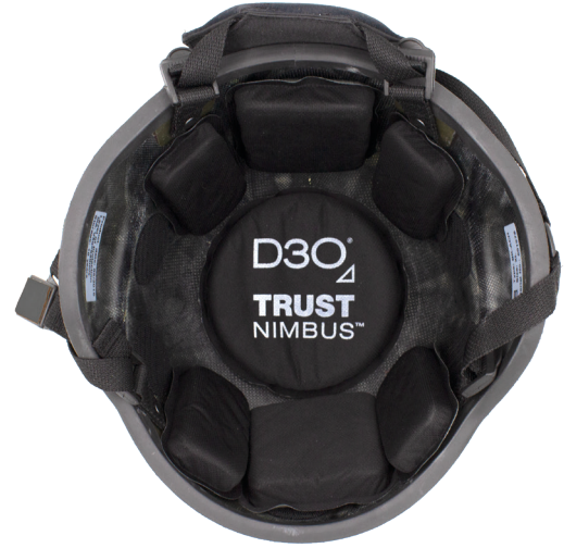
D3O® TRUST NIMBUS™ HELMET PAD SYSTEM